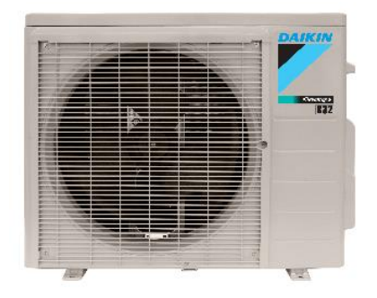
Daikin ENTRA Outdoor Unit

We are pleased to announce the release of Daikin ENTRA single zone systems with R-32 low-GWP refrigerant. This launch is in preparation for 2025 regulatory changes by the Environmental Protection Agency (EPA) under the American Innovation and Manufacturing (AIM) Act requiring low-GWP, A2L refrigerants. The new Daikin ENTRA heat pump systems with R-32 refrigerant meet 2023 U.S. Department of Energy (DOE) minimums in all U.S. regions.